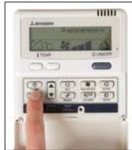
RCE1 Wired Controller