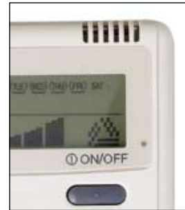
Integral Temperature Sensor

Energy Saving up to 34% with INVERTER Technology